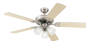
Reversible Light Maple Finish Blades