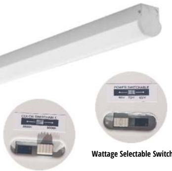
CCT Selectable Switch