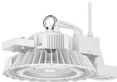
S1/S2 Factory Installed Sensor