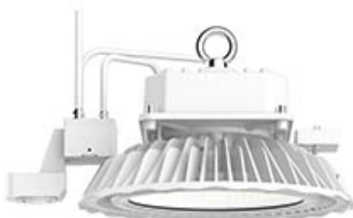
S1/S2 Factory Installed Sensor