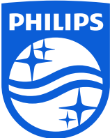
MSR GOLD 700 MiniFastFit