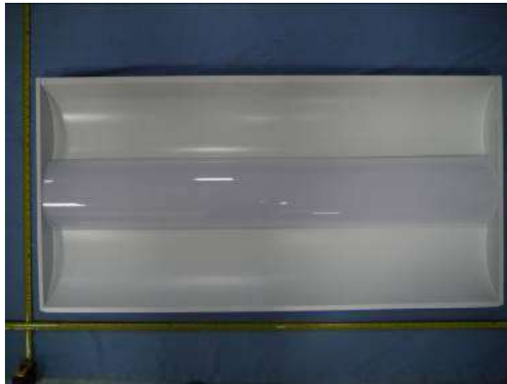
Fig.1- Overall view