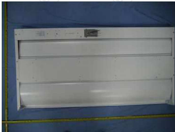
Fig.2- Back view