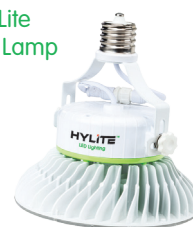
HyLite Lotus Lamp

Caution: Distance between SPD L, N, FG Wires and HyLite LED Arc-Cob, Omni-Cob and Lotus Lamp must not exceed 3 ft. (1m)