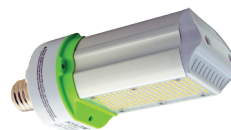
HyLite Arc-Cob Lamp