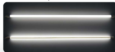
Lamp Back View