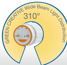
Lamp Front View

This lamp uses an innovative glass design that diffuses heat and light more evenly. As a result of its compact light engine, this lamp produces a light emitting area of 310°. This wider beam angle improves a fixture's total light distribution and creates a more complete lighting effect.