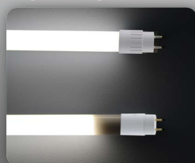
Other LED Tubes