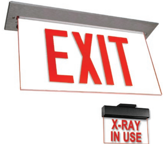
Custom legends available

Model: _____ Date: _____ Accessories: _____ Job Name: _____ Type: _____