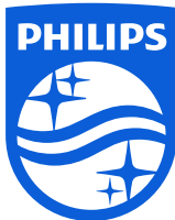
ELE BALLAST (3) F32T8 120-277V